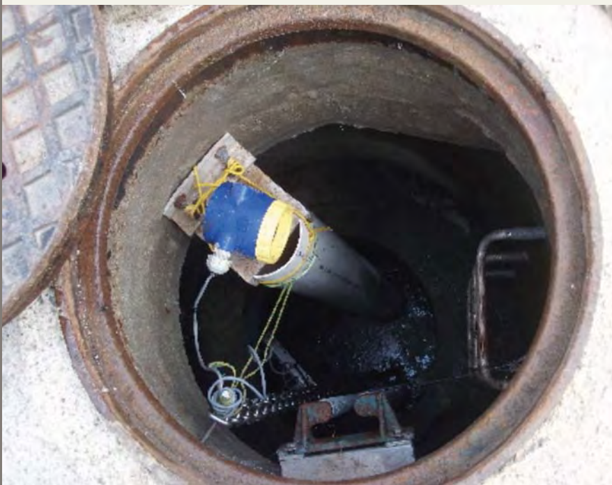
Influent wet well

To handle this, the RDN upgraded its Church Road transfer station near Parksville, BC. The upgrade included expanding the existing transfer building along with construction of a new building to handle commercial and source separated organic wastes