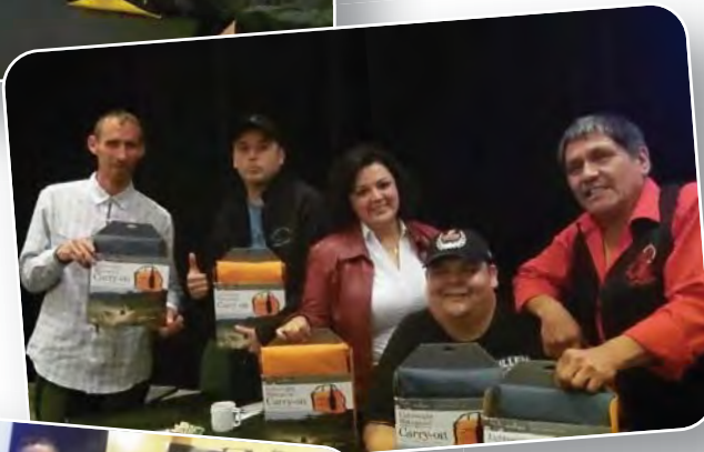
4th Place: Team Red