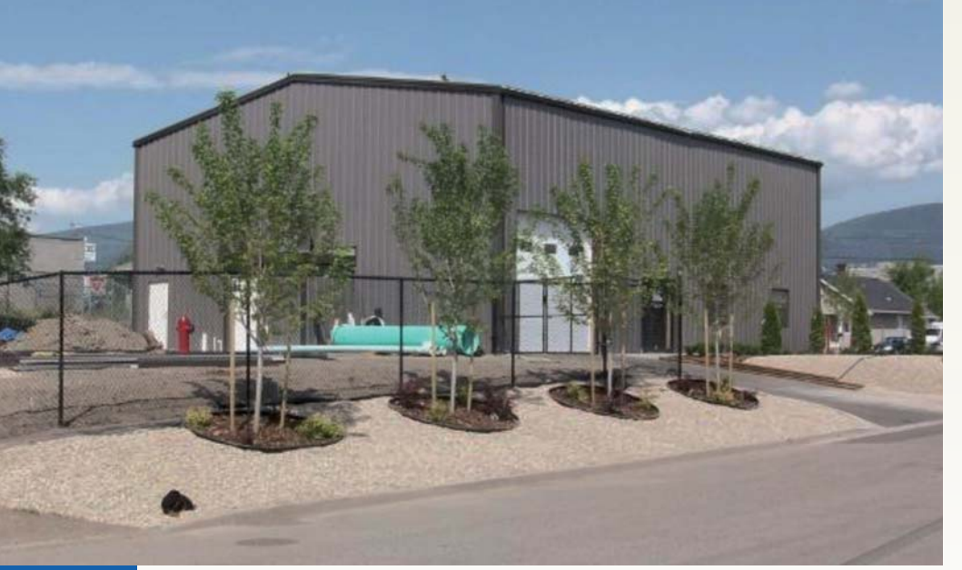
MTS Training Facility