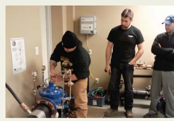
Control Valve Troubleshooting

Their website hosts a profile system for Operators providing a platform for tracking career path development and planning; if you receive their monthly updates you already have a profile, if not, register for one today www.mtsinc.ca or contact the office (250) 503-0893.