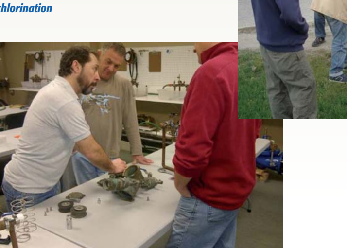
Backflow Assembly and Repair Training