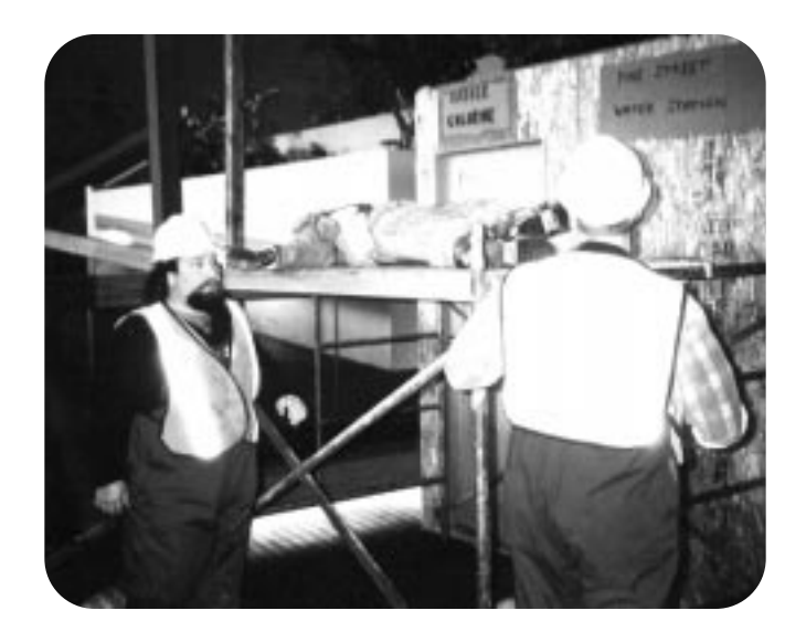
On arrival, the Safety teams find there has been a chlorine leak at the pump station; one injured worker there as well as the video contractor has been injured.

Public works dispatch two staff to the area and contact the foreman by radio to meet them at the Pine Street station to investigate the complaint.