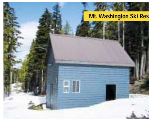
Mt. Washington Ski Resort

T he EOCP Board was well represented at a training, education and certification workshop held in Toronto, September 25-28, 2002, which was sponsored by Canadian Water and Waste Association (CWWA), Health Canada, Canadian Council of Ministers of the Environment (CCME), and the Ontario Ministry of the Environment. The goal of the workshop, which was attended by close to 50 representatives from federal, provincial, territorial, First Nations, and professional groups, was to develop a national path forward to ensure the consistency and adequacy of training programs for all of Canada. Since the recent incidents related to contaminated drinking water in Ontario and Saskatchewan, authorities across the country are reassessing their strategies for water and wastewater management. Part of this reassessment, is a review of certification requirements for water and wastewater operators country-