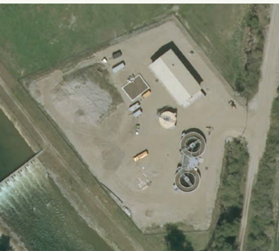
The Secondary Clarifiers within the circular Bioreactors not only saved concrete costs, but also help conserve heat, with the Combined Treatment Units having to be 70% above ground. In addition, it is much easier for the operators to compare foaming, supernatant and visual flows within the Clarifiers and Bioreactors with them in combined treatment units.