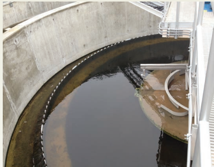
Secondary Clarifier with walls of circular bioreactor.

Effluent Reuse: Treated effluent is used for process, water maintenance functions and landscape irrigation. The heating and cooling