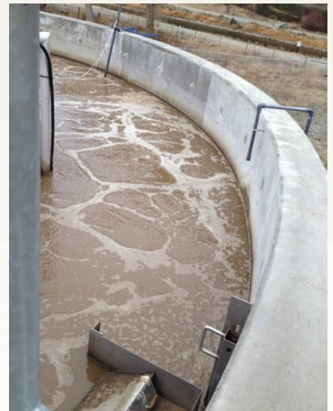
Last Aerobic Zone with Alum Addition (Grey Drip Pipe) and Surface WAS (wasting) Box. Surface wasting has proven very helpful in resolving foaming and removing floating solids, leaves, etc. that find their way into the Bioreactor.

system uses the treated effluent in various ways to provide up to 95% of the heating/cooling requirements for the building. Treated effluent is also used in the toilets and many other places around the treatment plant.