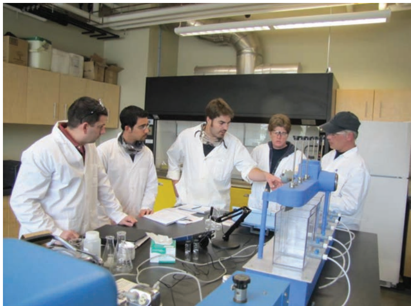
Water & Wastewater Laboratory

For more information about TRU's Water and Wastewater programs and courses, which are accredited by Environmental Operators Certification Program (EOCP) for continuing education units (CEUs), please visit