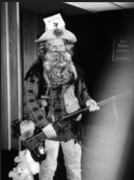
The "MAD TRAPPER" at the Annual 1998 BCWWA Conference @ Whistler.