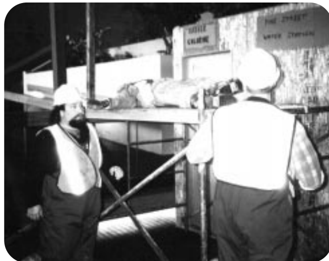
On arrival, the Safety teams find there has been a chlorine leak at the pump station; one injured worker there as well as the video contractor has been injured.

Public works dispatch two staff to the area and contact the foreman by radio to meet them at the Pine Street station to investigate the complaint.