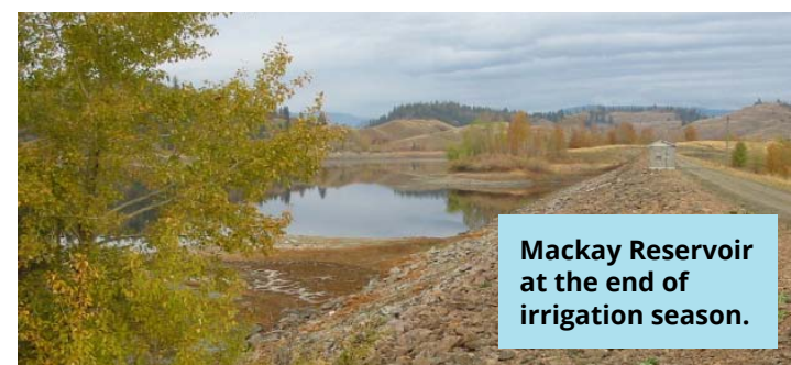
Mackay Reservoir at the end of irrigation season.