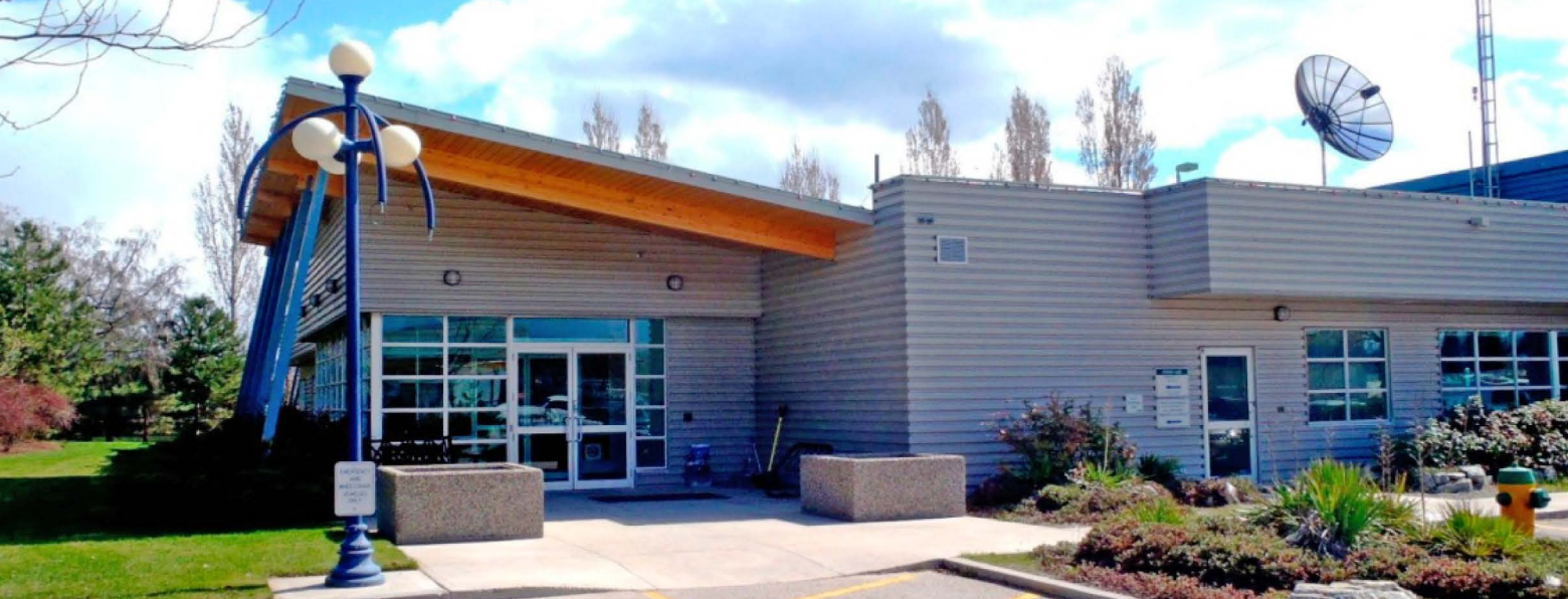
The Administration building.