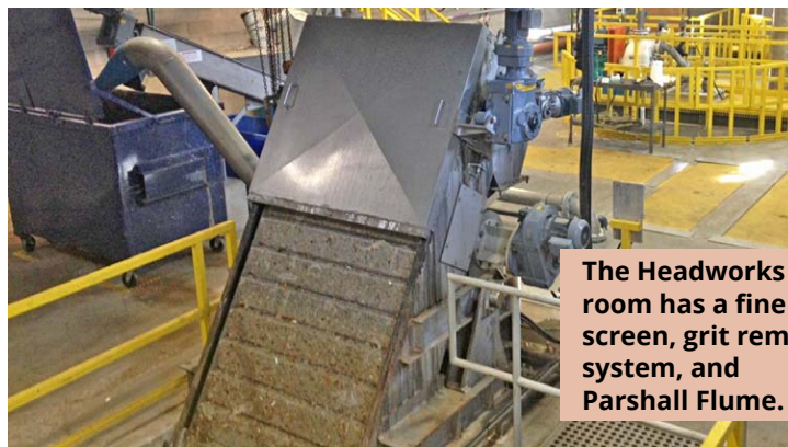
The Headworks room has a fine screen, grit removal system, and Parshall Flume.

The primary sludge is sent to the fermenter where it continues to thicken. The fermenter supernatant, which contains volatile fatty acids, is distributed into the anaerobic zone of all three bioreactors where it aids in phosphorus removal. The Waste Fermented Sludge (WFS) from the bottom of this tank is stored until dewatering. The Thickened Waste Activated Sludge (TWAS), flowing from the bottom of the secondary clarifiers, is thickened using one of the two DAFTs. The TWAS, WFS and a dose of polymer are pumped into two centrifuges where the solids and liquids are separated. Biosolids are trucked to the regional compost facility and processed into nutrient rich OgoGrow compost.