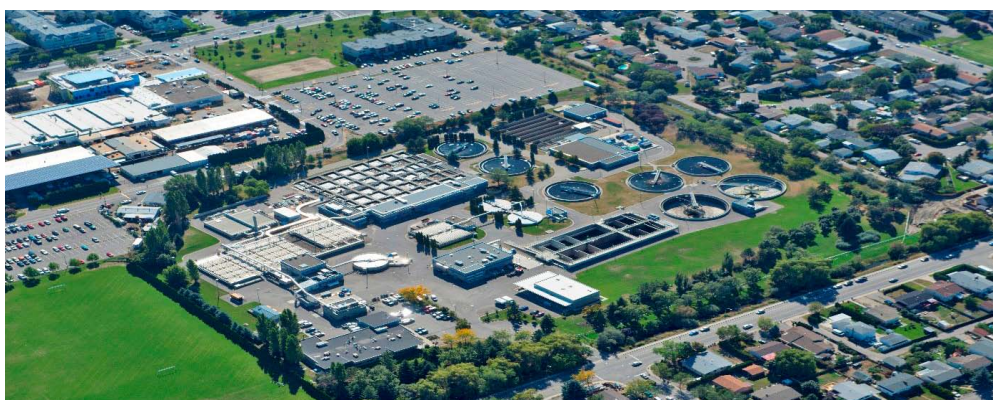
The Kelowna Wastewater Treatment Facility is located in a densely-populated area of the city surrounded by residential housing, Okanagan College and a high school.