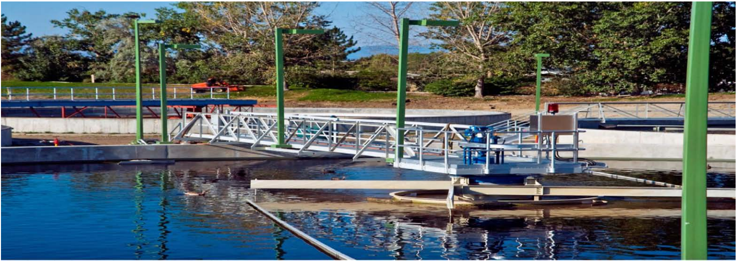
Secondary Clarifiers were part of the 2007 Upgrade. A state of the art odour control system contributes to community relations.

to reduce energy consumption. The time and research invested was worthwhile and delivered impressive results. The facility reduced its power consumption equating to enough power saved to service 40 homes in Kelowna area on an annual basis.