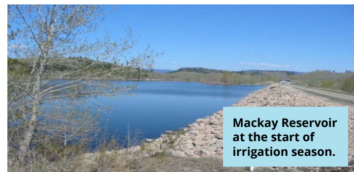
Mackay Reservoir at the start of irrigation season.